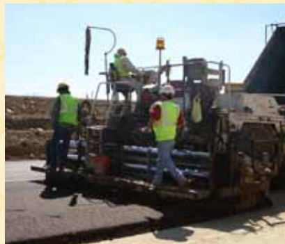
An Austin asphalt crew follows behind as paver places Hotmix on subgrade, preparing the asphalt for the rollers on SH 121.

The City of Fort Worth's goal is to be the best place for contractors to do business and to have the best infrastructure in the country. If you are not already a member of the City of Fort Worth's contractor pool, become one now. Register at the City's M/WBE Web site . Happy contracting! ■