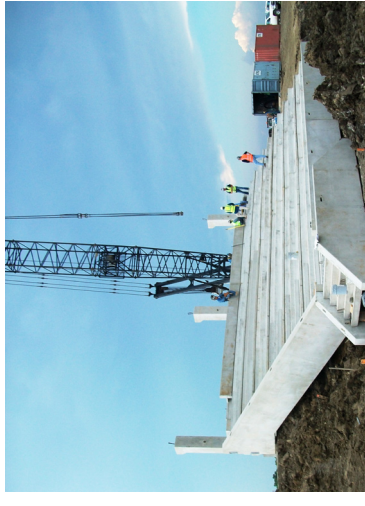
Crew members install precast for the stadium