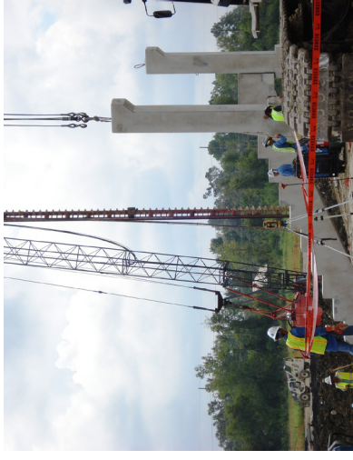
Hallmark Group / Turner Construction JV crew members install precast for the lower level of the stadium